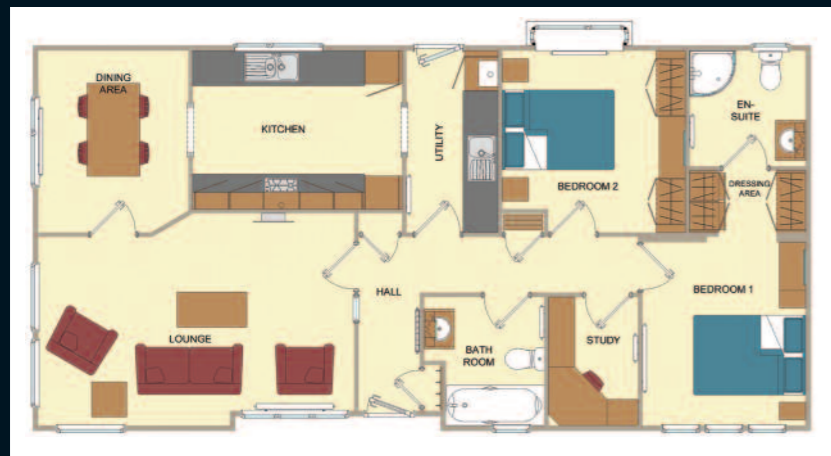
44' x 22' (13.411m x 6.622m) 2 bedrooms, study, 1 bathroom, & en-suite

The purchase of a new home is one of the most important decisions that you will ever make. Here at Omar, we aim to ensure that your purchase meets all of your needs and expectations without the stress that such a major purchase normally brings. Omar are highly dedicated to quality assurance, the environment, leading edge design and product development. We have a wide range of floor plans, styles and interior décors available for you to choose from. We also offer a bespoke design service working with people to create your dream home. Our flexible floor layouts ensure that we can cater for all requirements, which is ideal for those with disabilities.