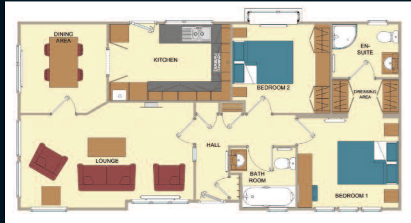
40' x 20' (12.192m x 6.012m) 2 bedrooms, 1 bathroom & en-suite

Below are two Colorado standard floor plans. We can modify floor plans to suit your individual requirements, please ask our sales team for further details. All of our homes are built to BS3632 (which includes all park homes and lodges) and come with a 10 year Goldshield structural guarantee.