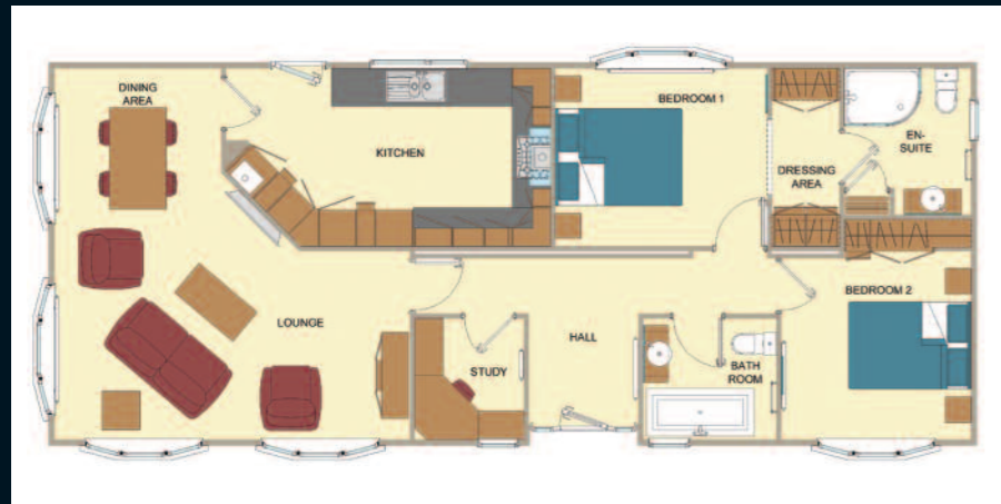
48' x 20' (14.630m x 6.012m) 2 bedrooms, study, 1 bathroom & en-suite

The purchase of a new home is one of the most important decisions that you will ever make. Here at Omar, we aim to ensure that your purchase meets all of your needs and expectations without the stress that such a major purchase normally brings. Omar are highly dedicated to quality assurance, the environment, leading edge design and product development. We have a wide range of floor plans, styles and interior décors available for you to choose from. We also offer a bespoke design service working with people to create your dream home. Our flexible floor layouts ensure that we can cater for all requirements, which is ideal for those with disabilities.