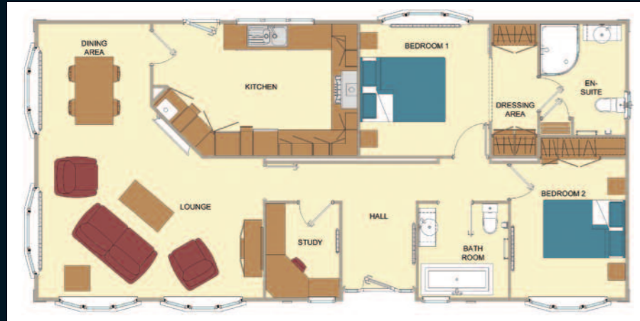
46' x 22' (14.021m x 6.622m) 2 bedrooms, study, 1 bathroom & en-suite

Below are two Heritage standard floor plans. We can modify floor plans to suit your individual requirements, please ask our sales team for further details. All of our homes are built to BS3632 (which includes all park homes and lodges) and come with a 10 year Goldshield structural guarantee.