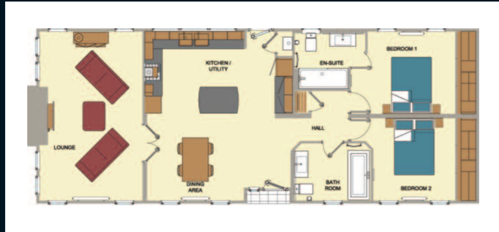
50' x 20' (15.240m x 6.012m) 2 bedrooms, 1 bathroom & en-suite