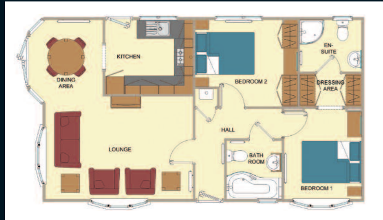
44' x 22' (13.411m x 6.622m) 2 bedrooms, 1 bathroom & en-suite

The purchase of a new home is one of the most important decisions that you will ever make. Here at Omar, we aim to ensure that your purchase meets all of your needs and expectations without the stress that such a major purchase normally brings. Omar are highly dedicated to quality assurance, the environment, leading edge design and product development. We have a wide range of floor plans, styles and interior décors available for you to choose from. We also offer a bespoke design service working with people to create your dream home. Our flexible floor layouts ensure that we can cater for all requirements, which is ideal for those with disabilities.