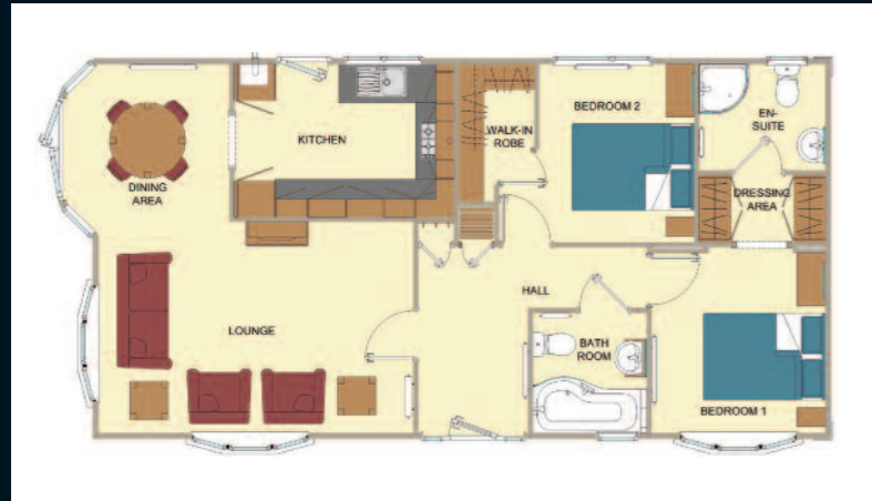
40' x 20' (12.192m x 6.012m) 2 bedrooms, 1 bathroom & en-suite

Below are two Sandringham standard floor plans. We can modify floor plans to suit your individual requirements, please ask our sales team for further details. All of our homes are built to BS3632 (which includes all park homes and lodges) and come with a 10 year Goldshield structural guarantee.